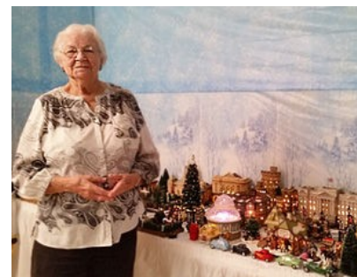
Bringing Christmas back for the elderly and infirm