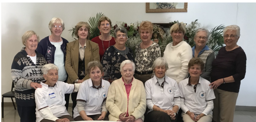
North Carolina Associates at their retreat

In Jamaica the presentation will be used as their Advent retreat. Miami is scheduled for the first Saturday in 2019, Tampa will follow at the end of that month, and Allegany will be right after Easter. New Jersey has not been scheduled yet.